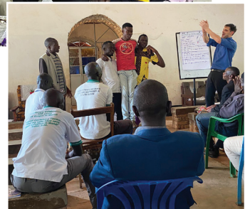
ABOVE: Using the Growing Leaders/ARROW Course material from CPAS and the life of Gideon to think through who gets the glory from our ministry?