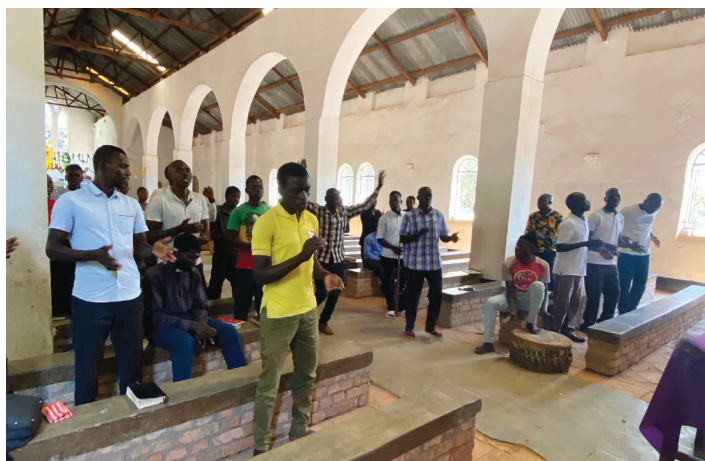
Worship in Yambio