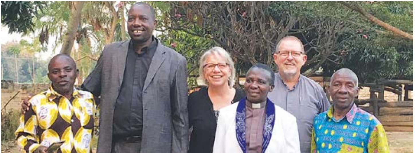
SOMA Tabora Team

Do you have a heart for justice, a desire to minister in the power of the Holy Spirit and excellent communication skills?